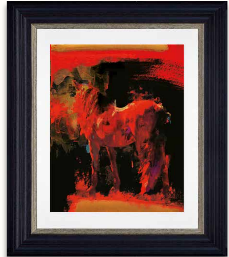
Newton Series II Red B